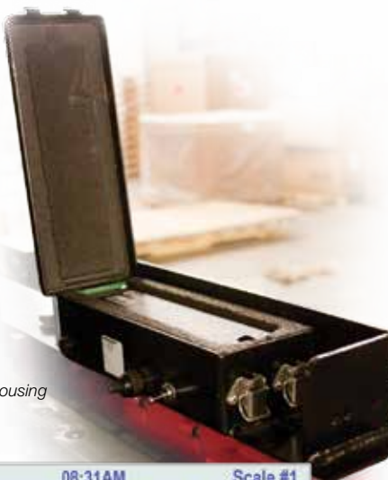
Wireless battery housing

The wired or wireless scale-to-indicator systems are available with either the CLS-920i or the CLS-420.