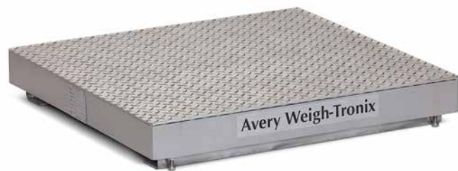
Low capacity stainless steel