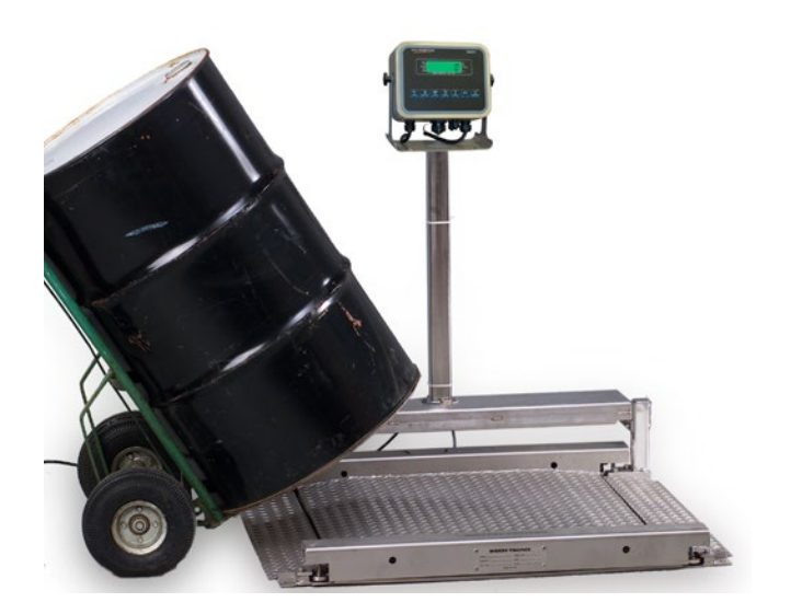
Stainless steel with optional indicator bracket