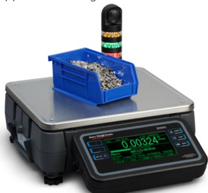
175 lb (80 kg) and 70 lb (35 kg) models 12 in x 14 in (305 mm x 355 mm) platter

A robust die-cast clamshell enclosure provides protection for the Quartzell transducer. 1100% overload protection and a spring breakaway mechanism protect the cell from shock and dropped loads, ensuring accuracy and repeatability in even the most extreme conditions.