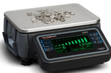
70 lb (35 kg) model 9 in x 12 in (230 mm x 305 mm) platter