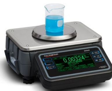
10 lb (5 kg) and 2 lb (1 kg) Models 6 in (150 mm) round platter